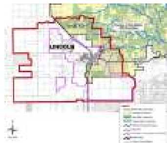
This map of Lincoln shows which portion of the city will be served by the new regional water treatment plant.

The Nevada Irrigation District held its first in a planned series of Lincoln area public meetings on a multi-phase regional water supply project on March 4 at Mt. Pleasant Hall.